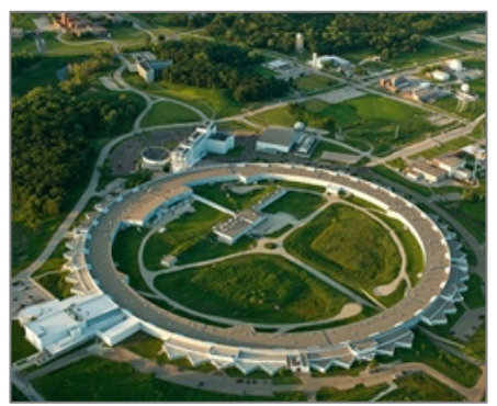
Advanced Photon Source at ANL