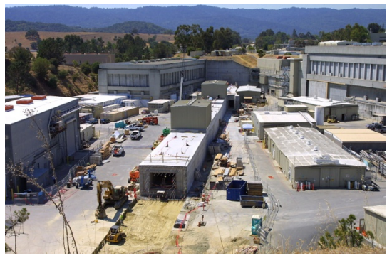
Linac Coherent Light Source (LCLS) Beam Transfer Hall (under construction)