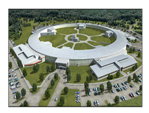
National Synchrotron Light Source – II (NSLS-II) at BNL (rendering)