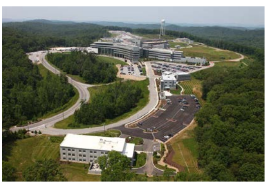
Spallation Neutron Source at ORNL