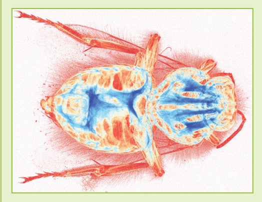
Color image of a bumblebee taken with Medipix3 on silicon, 55μm pitch, 7x8 tiles, 20kV / 100μA / Mag. 4x, Object height ~25mm.

The experience gained in the continued development of these imaging circuits has come full circle and the latest chip in this series, Timepix3, meets the requirements for the LHCb upgrade experiment with minor modifications.