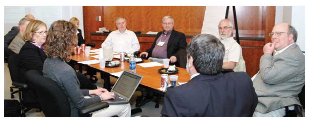
Participants are brainstorming during a breakout sessions about how best to handle specific recruitment, retention and promotion situations.

Eliminating or even merely lessening bias will benefit everyone; that will allow the cream to rise to the top, regardless of gender, race, or ethnicity, and everyone will have a chance to reach their full potential. Once bias is recognized, how do institutions go about countering it? Two areas in which to